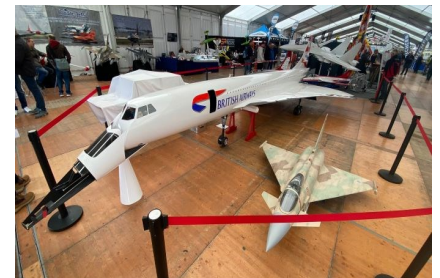
at Jet & Pro Germany

We truly hope to succeed in giving all associated members our full support and to fulfil our responsibilities to the best of our abilities. Please do not hesitate to approach members of the